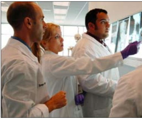
AMEC students at LECOM