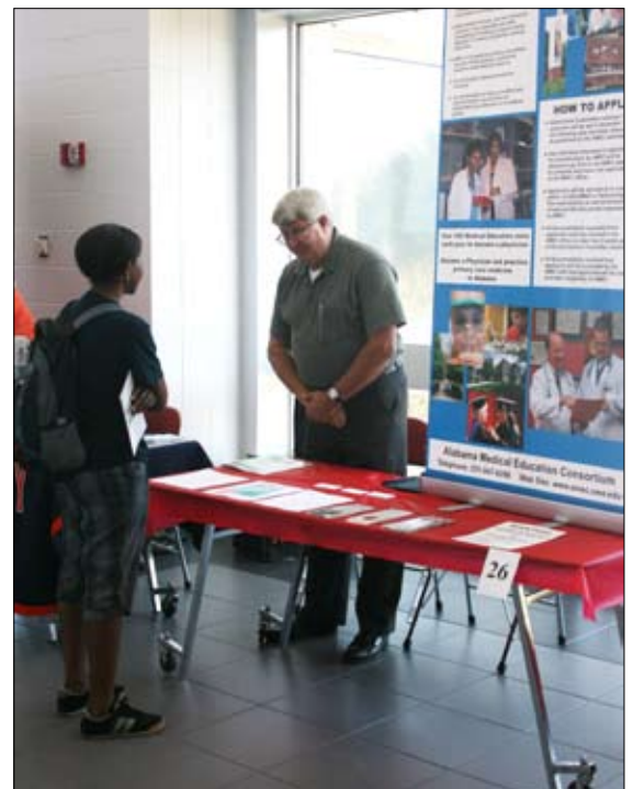
AMEC recruiter at Alabama Connection Fair