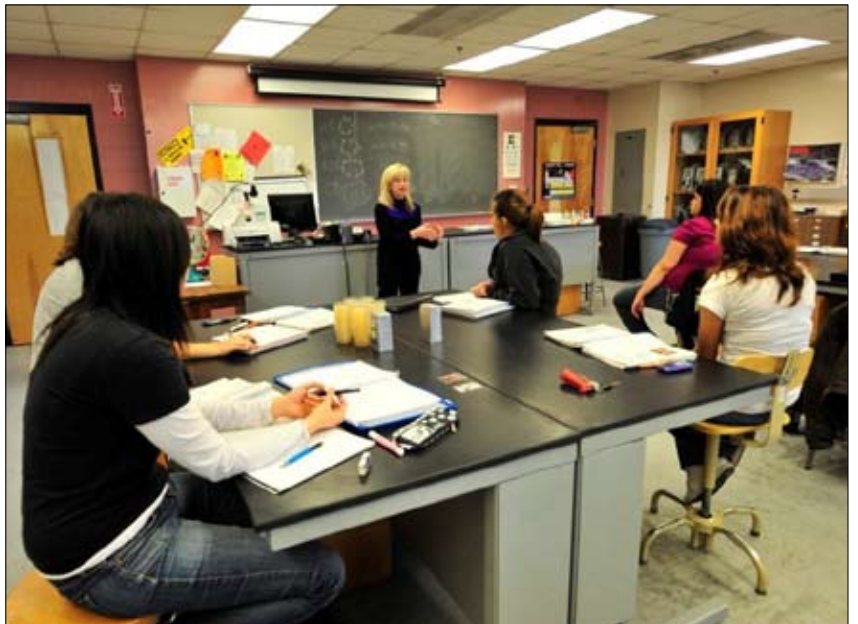
Recruiter promoting AMEC

Our recruiters targeted the pre med and faculty advisors at our partner colleges and universities, coordinated their efforts in student orientations and job fairs, and were creative in finding ways to interact directly with potential applicants. This paid huge dividends in that students from 13 Alabama universities and 4 community colleges were successful applicants to AMEC's partner colleges of medicine. Geographically, they represented 19 counties located in the Alabama rural areas (north and south), the Black Belt and all designated Metropolitan Statistical Areas.