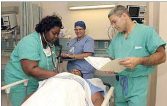
Pikeville student at Sylacauga Core Site