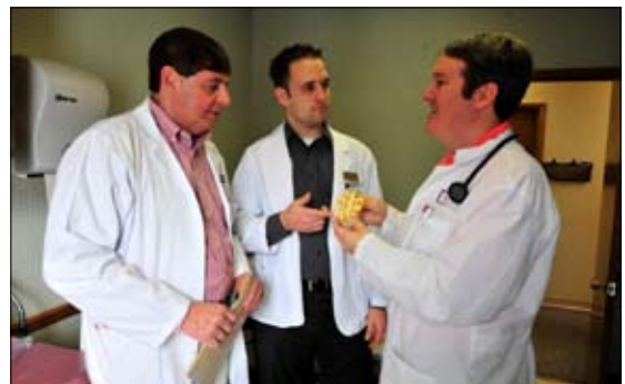
A.T. Still Students at SOMA Program Troy