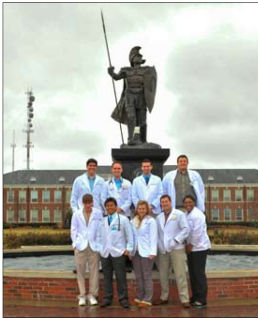
AMEC Students in Troy