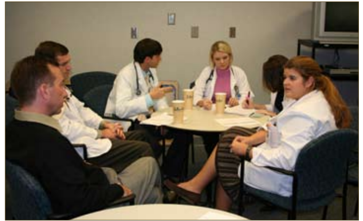
Montgomery Family Medicine Residency Program

The Alabama Medical Education Consortium (AMEC) approach has its foundation in a community based osteopathic primary care model. This model provides extensive learning in a hands-on approach for students in all aspects of their education. It is AMEC's philosophy that this model best provides the optimum educational experience for a physician of the 21st century.