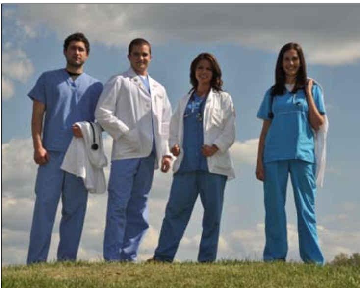
Pikeville College of Osteopathic Medicine Students