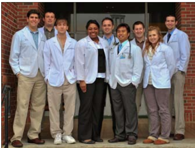
AMEC students at Troy

This first cohort of AMEC/SOMA students completed their first year of medical school in July 2008 and immediately began preparation for relocation to Troy, Alabama. Three days per week students are in the classroom where Dr. Wil-